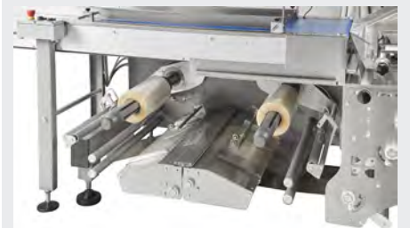
Automatic Reel-to-Reel Splice Option