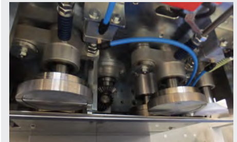
Overhead Sealing Wheels Assembly