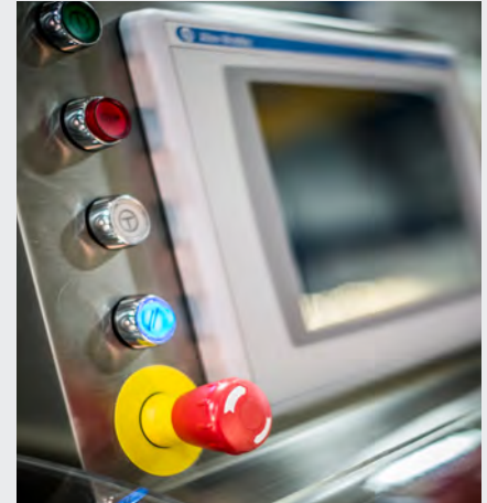
Icon-Based Operator Interface with Intuitive Set Up Features

A few of the many available options include twin jaws configuration, reel runout sensor misplaced product detect, product high sensor, pin type perforator, infeed extensions, gusseting units, crimp carry over unit, euroslot crimp jaws, labellers