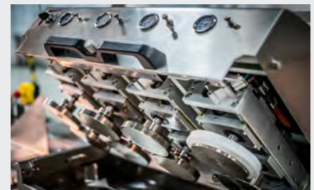
Quick changeovers and easy-to-clean features